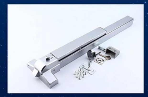
Single side door series

Stainless steel precision casting tongue, resisting strong impact. Copper lock cylinder, smooth unlocking Thick and hard paint finish, more corrosion resistant, more wear resistant 65CM-100CM length optional