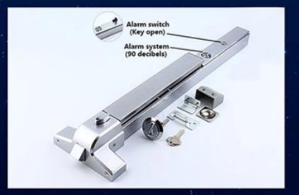
With alarm function series