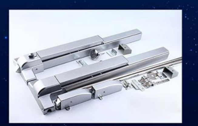
Double door series