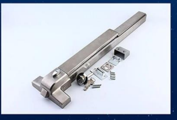
Stainless steel series